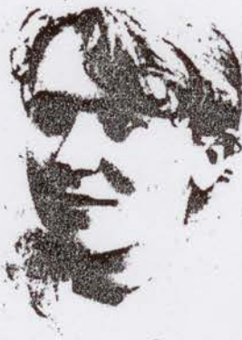
Emma Goldman in 1886