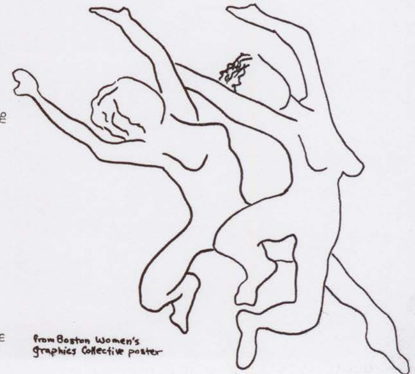
from Boston Women's Graphics Collective poster

After reading of your existence in Off Our Backs, i thought it important to make contact--